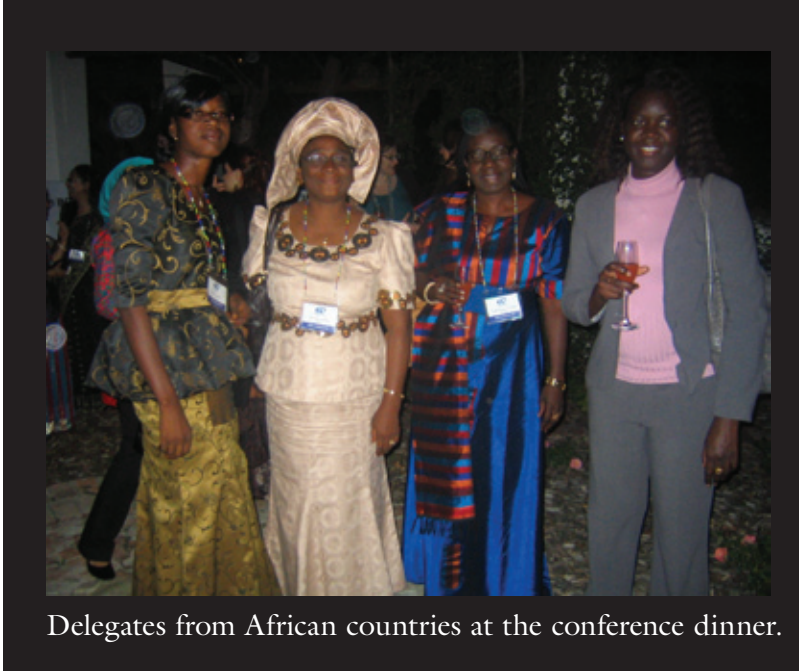
Delegates from African countries at the conference dinner.

to be solved in physics—across cultures and independent of particular obstacles, was the strongest result of the conference.